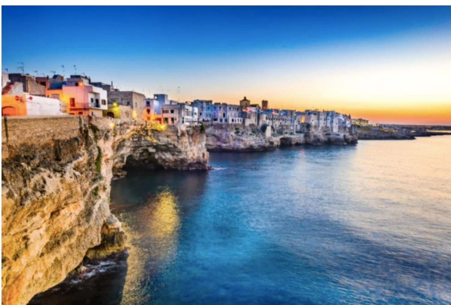
Polignano a Mare

Leading luxury global tour operator, Scott Dunn has introduced a new collection of destination itineraries - 'Perfect Pairings', which elevate the idea of the 'long weekend' to another level.