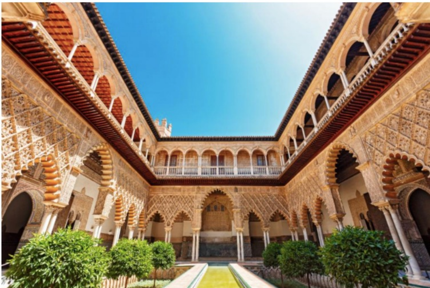
Palace of Alcazar, Seville

Guests begin their adventure at Corral del Rey, tucked away on one of the narrow streets of Seville's old quarter. This whitewashed boutique hotel is a reinvention of a 17th-century casa boasting panoramic views of the city. Here, guests will gain insight into authentic Sevillian life by dining with a local, enjoying a privately guided walking tour away from the crowds and discovering the best 'bites' in the region on a foodie safari by bike. This is discreetly luxurious eco-retreat set high in the Serranía de Ronda, Andalucia. Guests can hike and bike to their retreat's content in the Sierra de Grazalema National Park, or try horse riding as the estate is complete with 70 Lusitano horses, a dressage area plus lessons and trails for everyone from novice to experienced. Prices start from £4,400 per person based on 5 nights