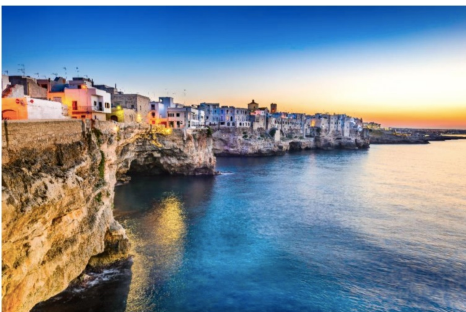
Polignano a Mare

Leading luxury global tour operator, Scott Dunn has introduced a new collection of destination itineraries - 'Perfect Pairings', which elevate the idea of the 'long weekend' to another level.