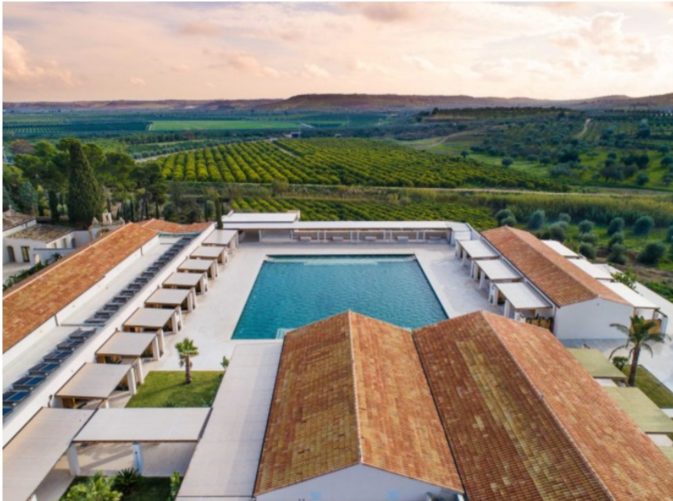
Il San Corrado di Noto

Il San Corrado di Noto is the first boutique resort of its kind in Sicily's UNESCO World Heritage site, Val di Noto