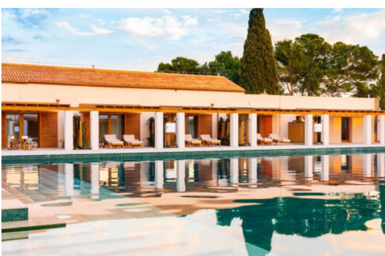
Il San Corrado di Noto Sicily Luxury Experience