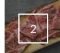
Oh, You Wagyu JANUARY 26, 2022