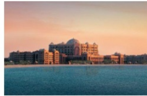
Emirates Palace Now Offers a Butler Purely for IT