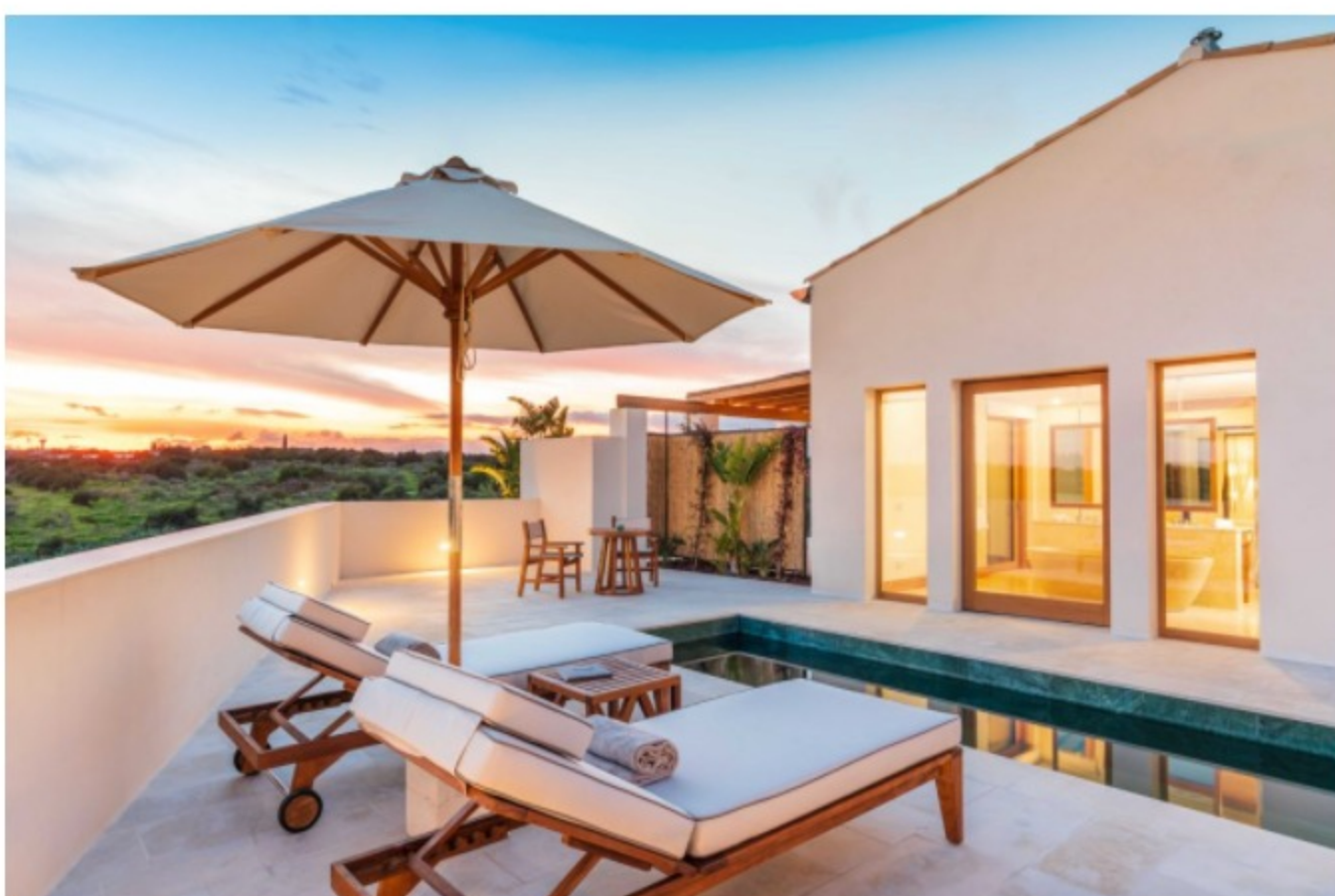
Il Sancorrado di Noto

The transformation has been a sensitive one. While all the expected mod cons are present, the masseria's 18th-century architecture has been preserved and heritage features intrinsic to the building's history were prioritised during the restoration. Architect Corrado Papa has also drawn upon natural materials, such as Modica stone and Guatemalan marble, sculpted by local stonemasons and woodworkers to highlight the suites, public areas and original chapel (which dates back to 1836).