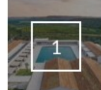
Destination of Noto JANUARY 28, 2022