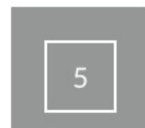
Surf's Up. And Under? JANUARY 19, 2022