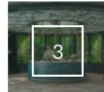
The Perfect Serve JANUARY 24, 2022