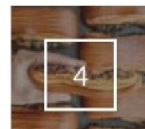
Bunch of Flours JANUARY 21, 2022