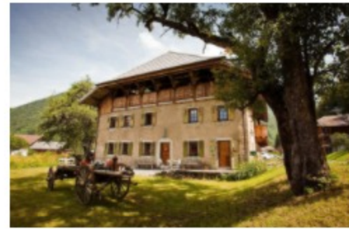
LUSSO Gets it's Lay-Ho-Di-Lay Oh-Di-Lay-He-He on, in Geneva