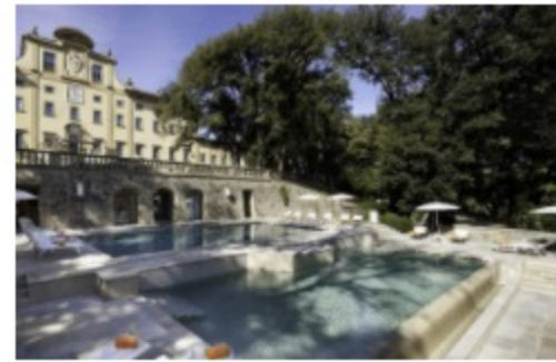
Go With the Flo: The grandest of Florence's country piles