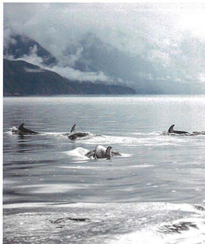
From top: mountains in the Yukon; Klahoos Wilderness Resort; dolphin spotting nearby